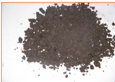
Eco-san compost (odour free)