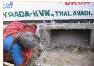
Decomposed human waste ready to harvest