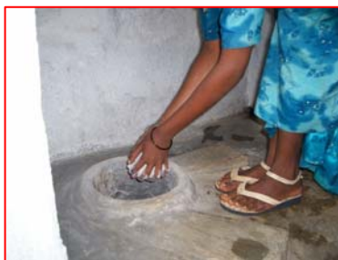
Addition of ash/leaf litter to human faeces