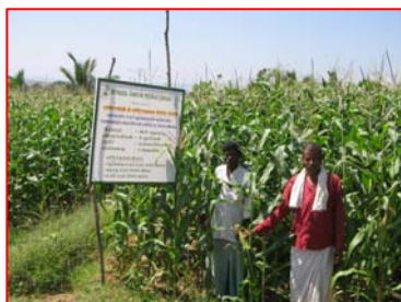
Eco-san compost trial at maize field - Talavadi